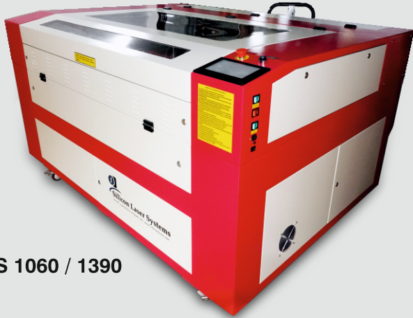
SLS 1060 / 1390