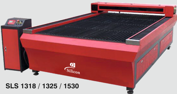
SLS 1318 / 1325 / 1530

Materials : Acrylic, Crystal, Bamboo, Cloth, Fabric / Denim, Fiberglass, Glass, Laminated Plastic, Leather, Marble, Plastic, Paper, Rubber, Wood, MDF, Marble, Anodized Aluminium, Coated Metal, etc.