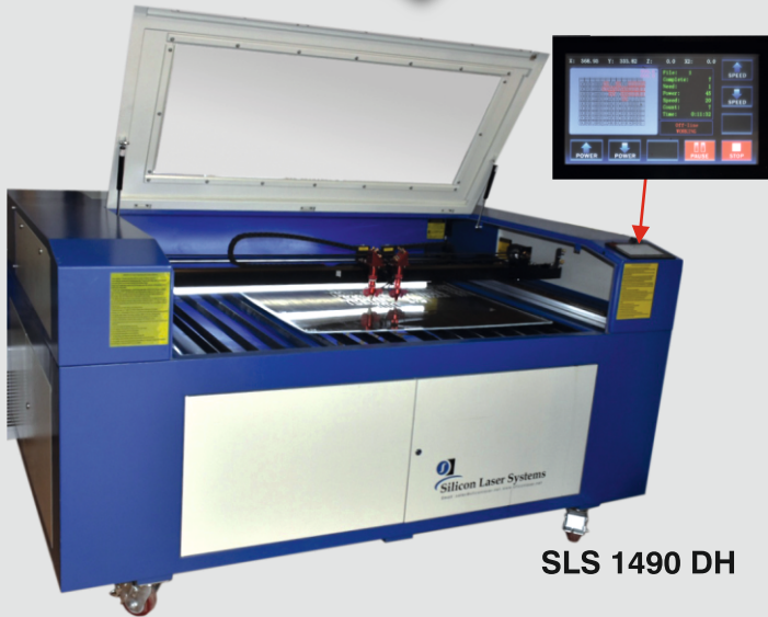
SLS 1490 DH